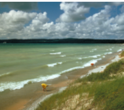
Lake Michigan beach, Petoskey, Michigan

The Agreement and its institutions are only as effective as the check and balance assurances that its obligations will be executed. As such, implementation of its goals and objectives must be dele-