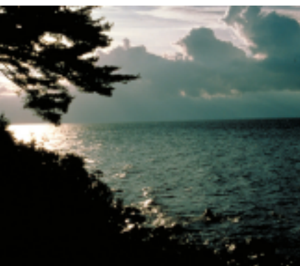
Chequamegon Bay, Lake Superior, Wisconsin

The IJC has no formal regulatory or enforcement powers under the Agreement, but it does have authority for oversight and monitoring progress toward achieving objectives by the United States and Canada. Both governments committed to the terms of the Agreement and accepted responsibility to honor it. The Parties (the governments) carry the responsibility for compliance. The relative roles and responsibilities of federal, state/provincial and local governments were left to each nation to determine, and this has been a significant factor in failures to achieve objectives, because