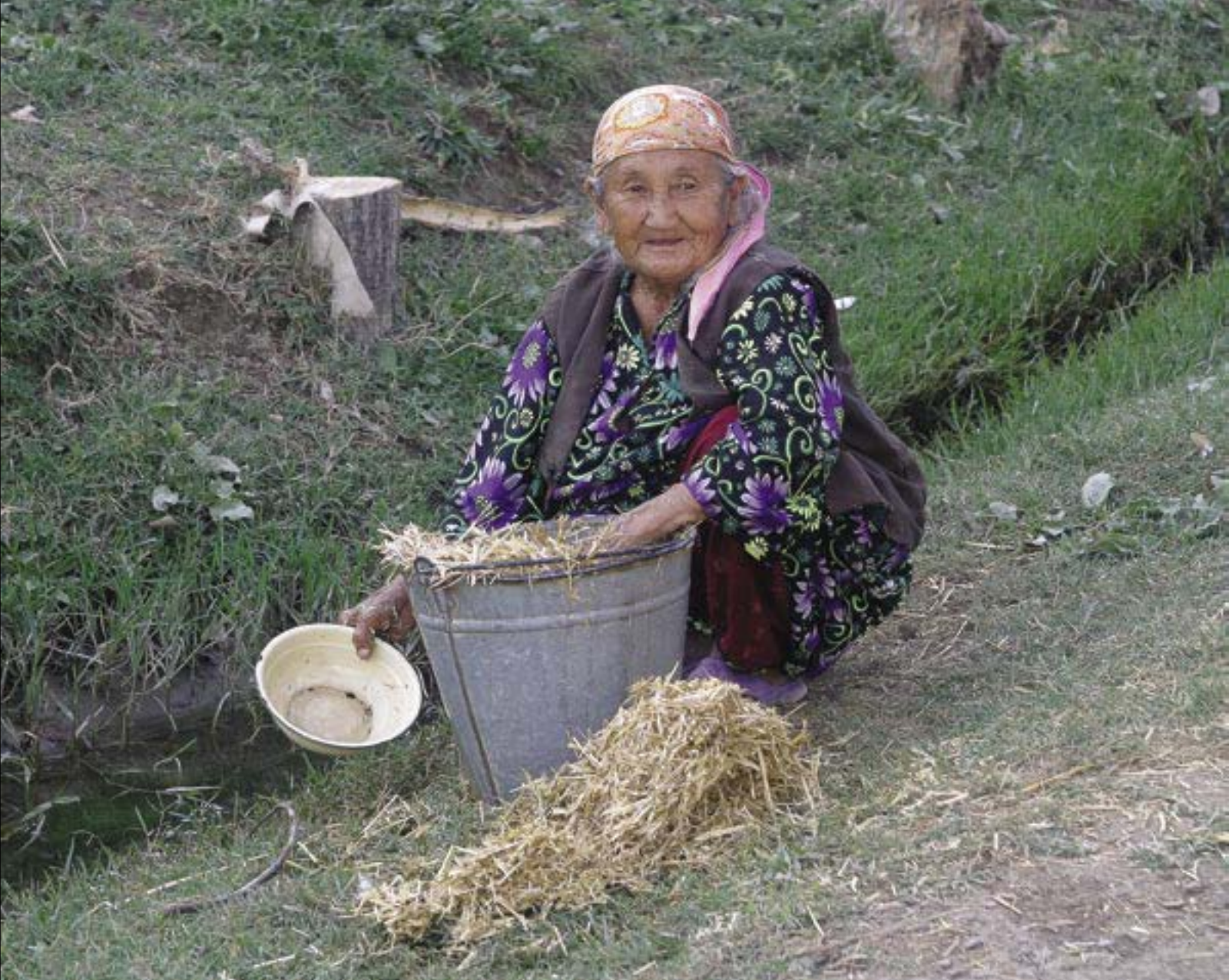
Photo left top. Soon we will have a water pipe line here.

Photo left below. It's a woman's job to carry water, it takes time and it's tiring. When the pipes are there, there will be more time for our children.