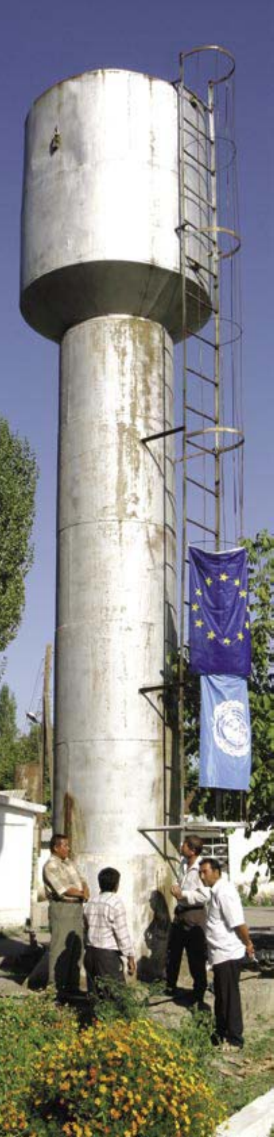
Photo right below. This is going to change, no more water waste, the water tank will serve its purpose again.

Photo right above. It's a daunting task and will take time, but the most important thing is to start.