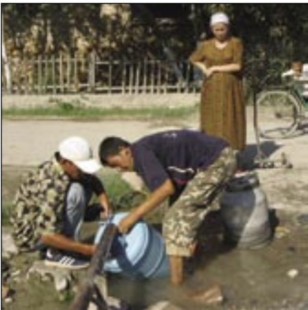
Photo right. When I grow up... I want be healthy and strong. Clean water will help.

Photo top #1. We will climb up there and get this thing do its job again.