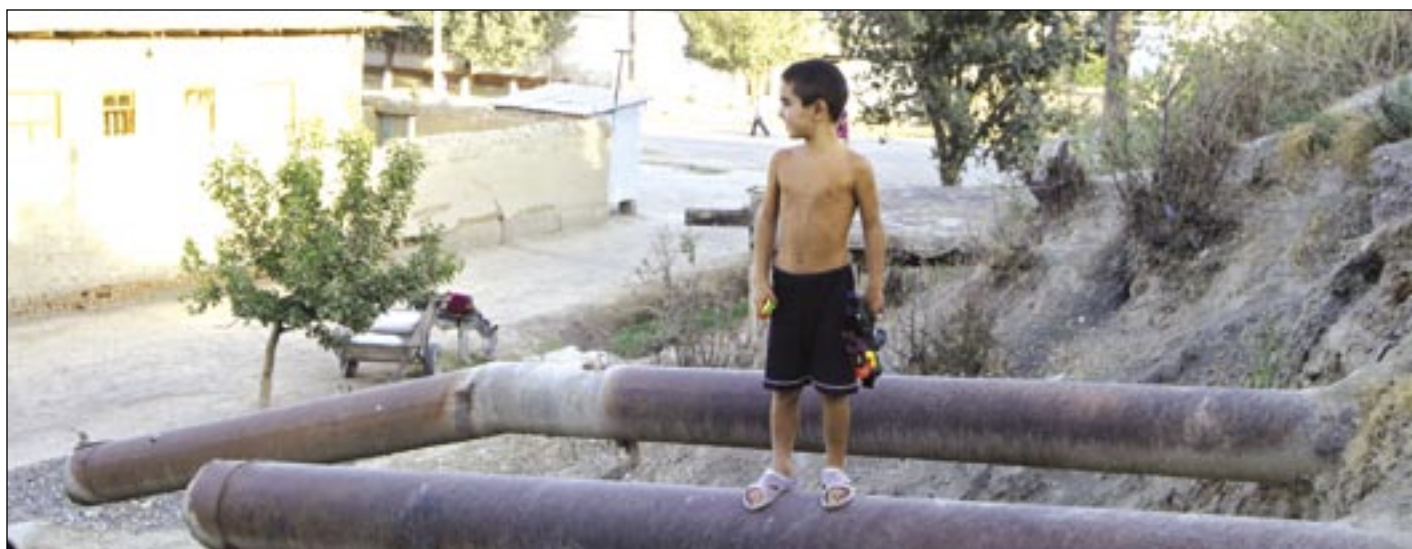
Photo right below. These pipes will bring water to everybody in the community.

Photo right top. This is the way things are here in Oygiron, but thanks to my children they will change soon.