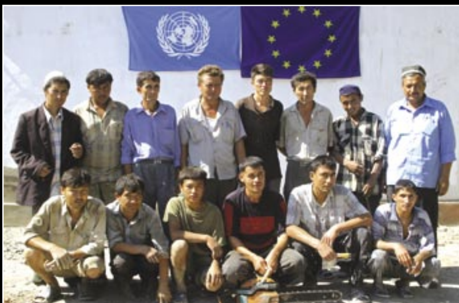
Photo top #1. Representatives of Chordona community contribute equipment, machinery and their own time to rebuild a community medical centre.