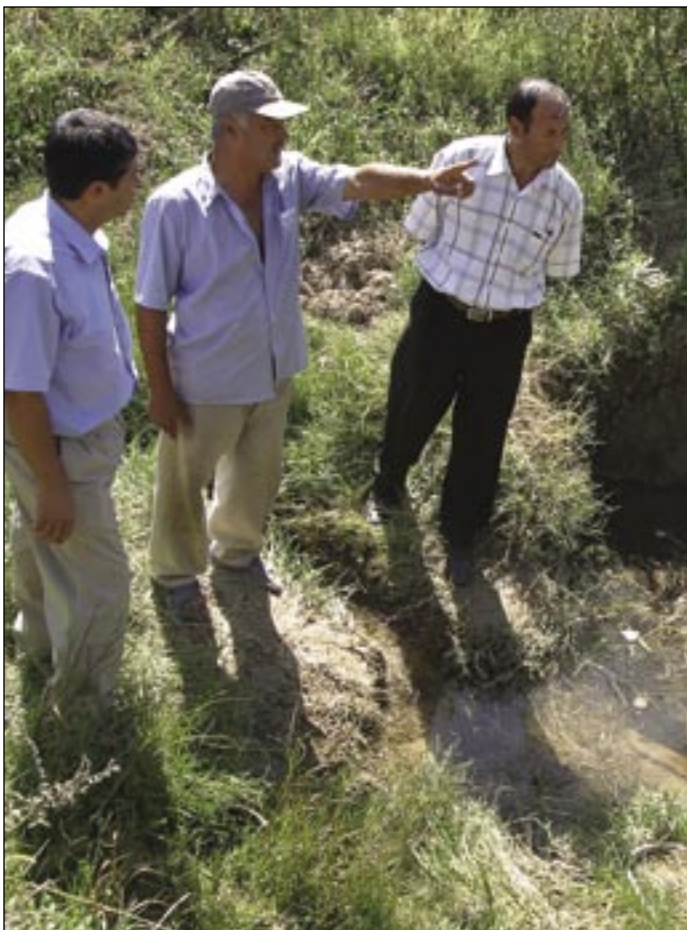
Photo below right. ...and people will not have to walk the streets in the sun and the snow carrying buckets of water.