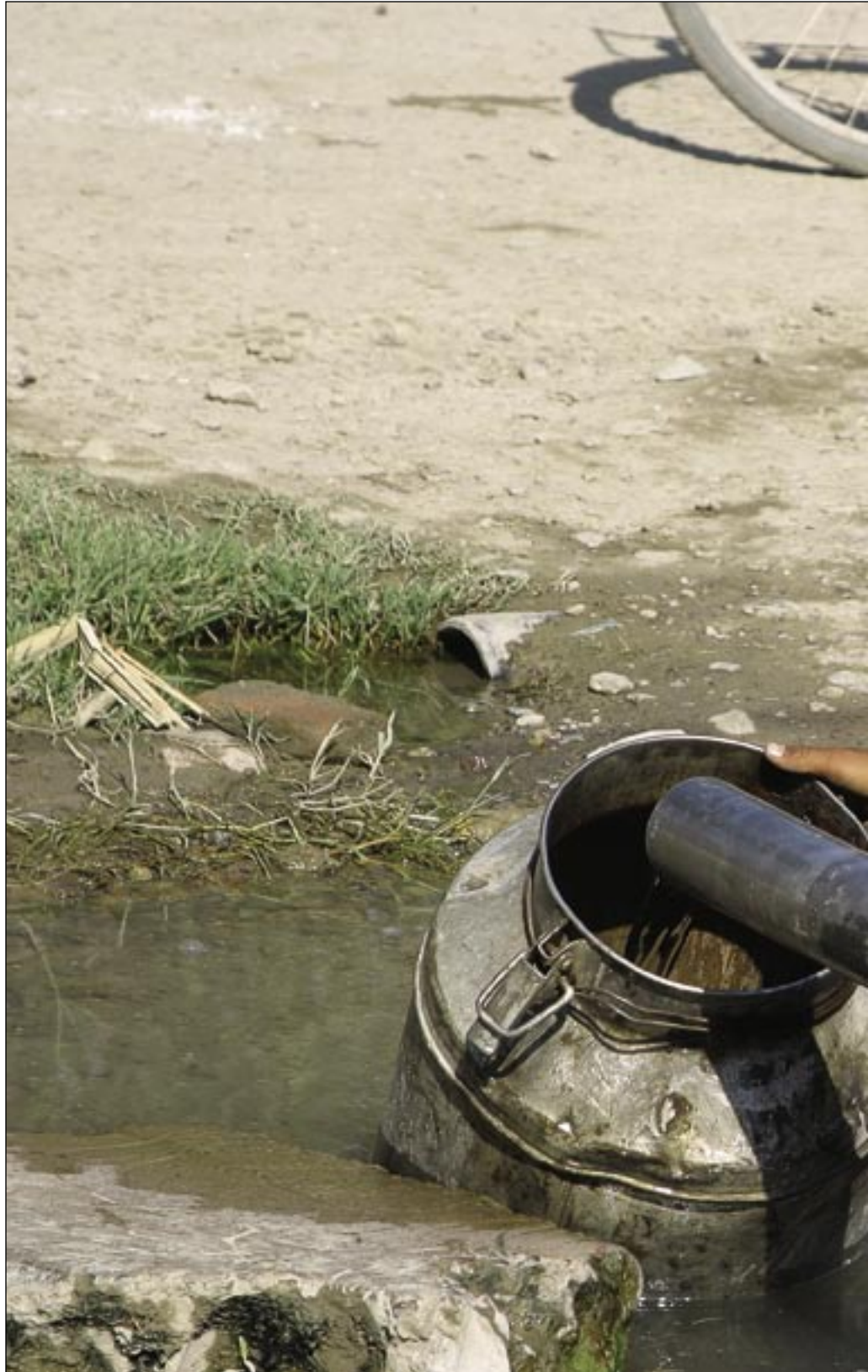
Photo top #2. Carry water is mainly a woman's job, but men help too.

Photo top #1. We will climb up there and get this thing do its job again.