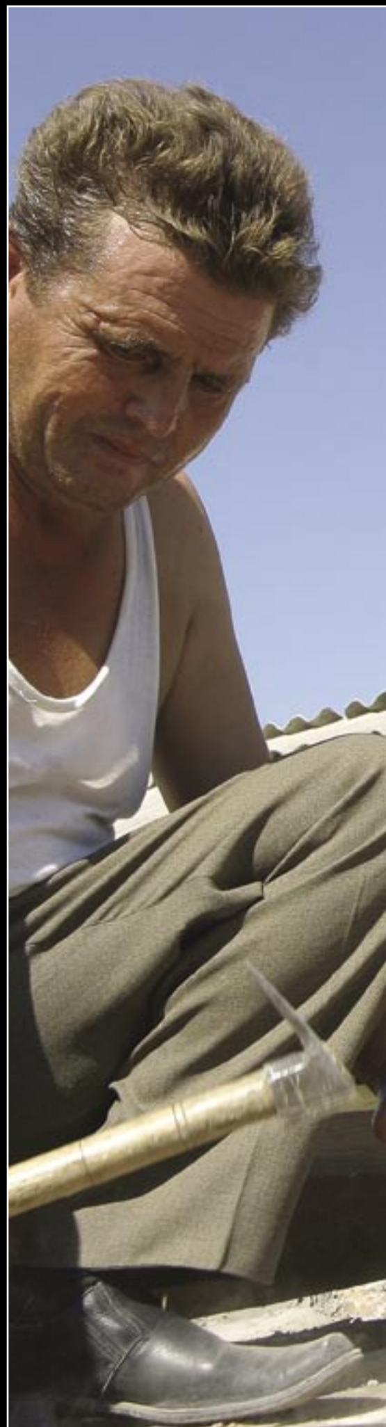
Photo right. Namangan region is famous for its masonry work. Chordona community is keeping up the reputation.